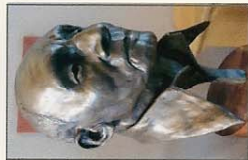
Edgar "Skunk" Pepper